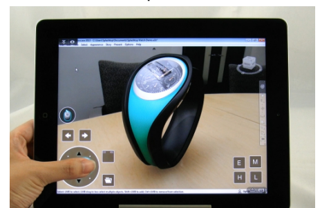
Use customized controls for 3D CAD/CAM on iPad